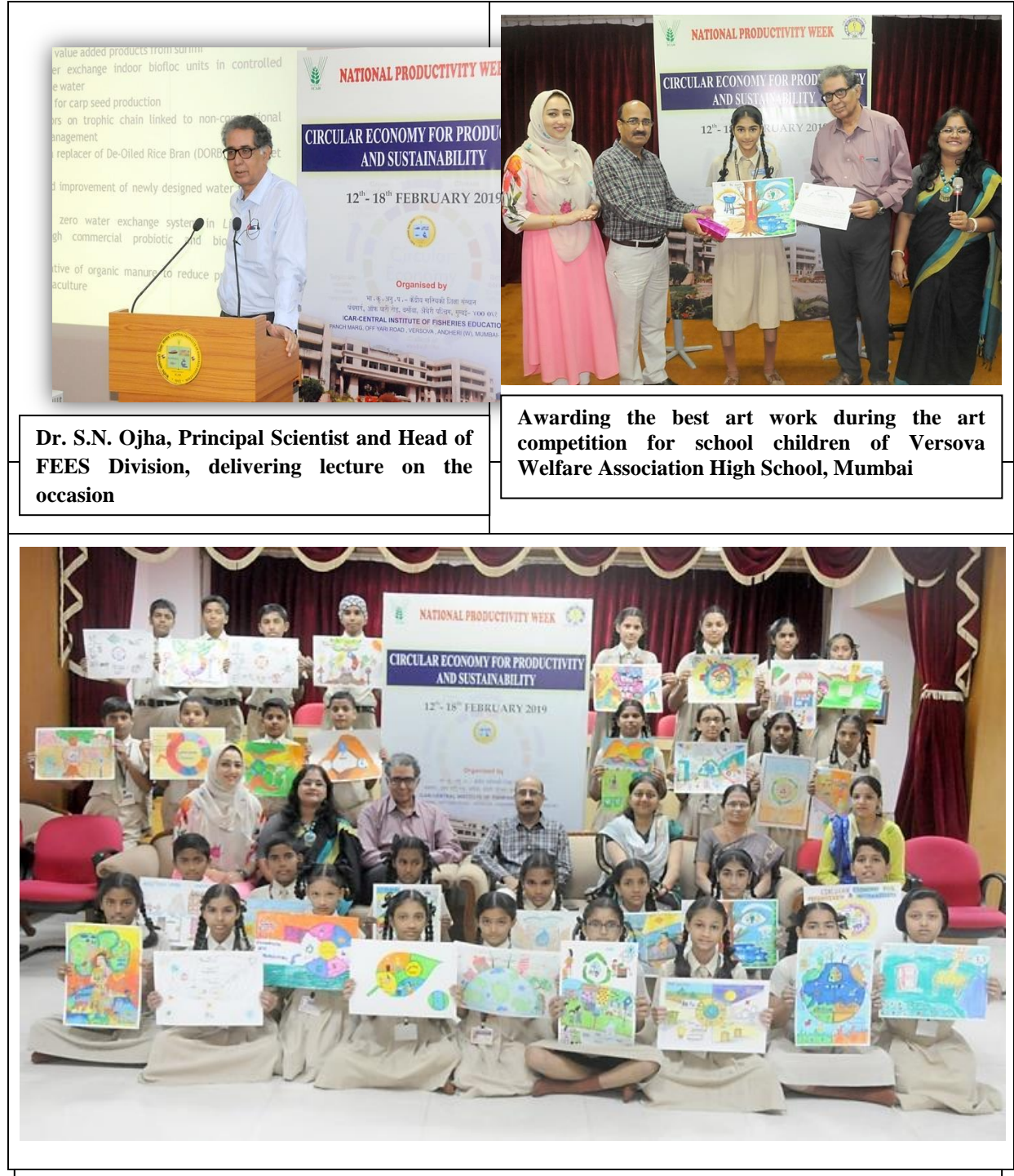
Children exhibiting their artwork on "Circular economy for productivity and sustainability"